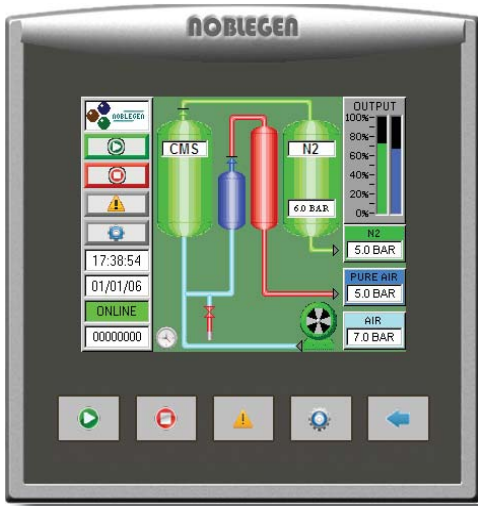
model ANG1-1 shown